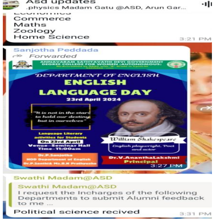
Brochure shared through whatsapp to all the student groups