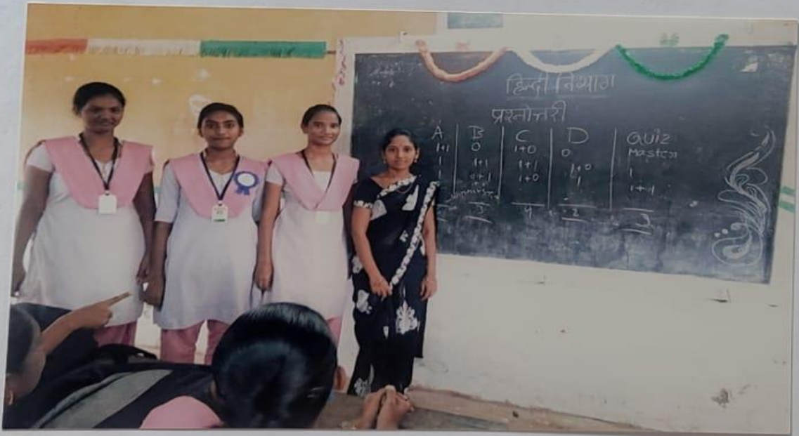
Winner Team - A