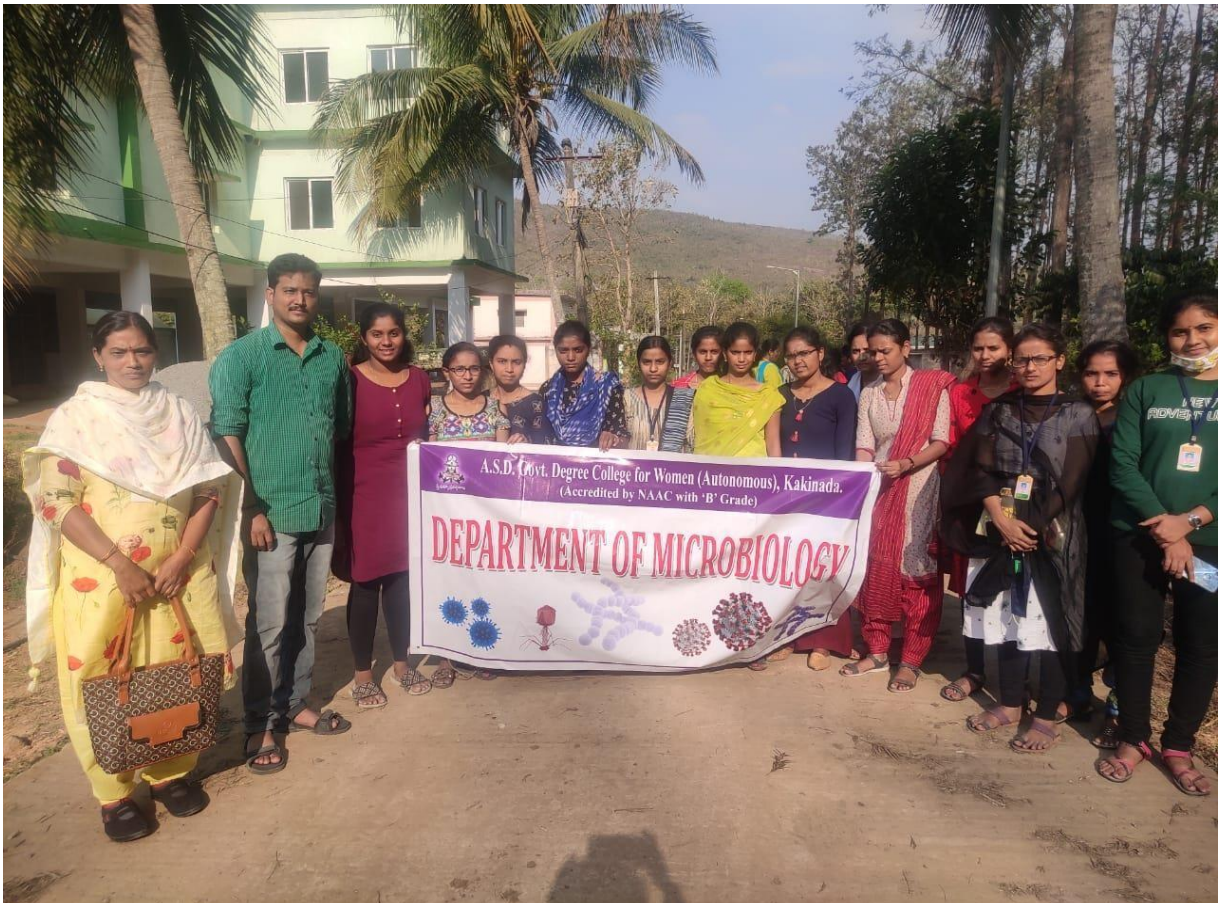
Field visit to Spices Research Station, Chintapalli, Visakhapatnam (Dist.)