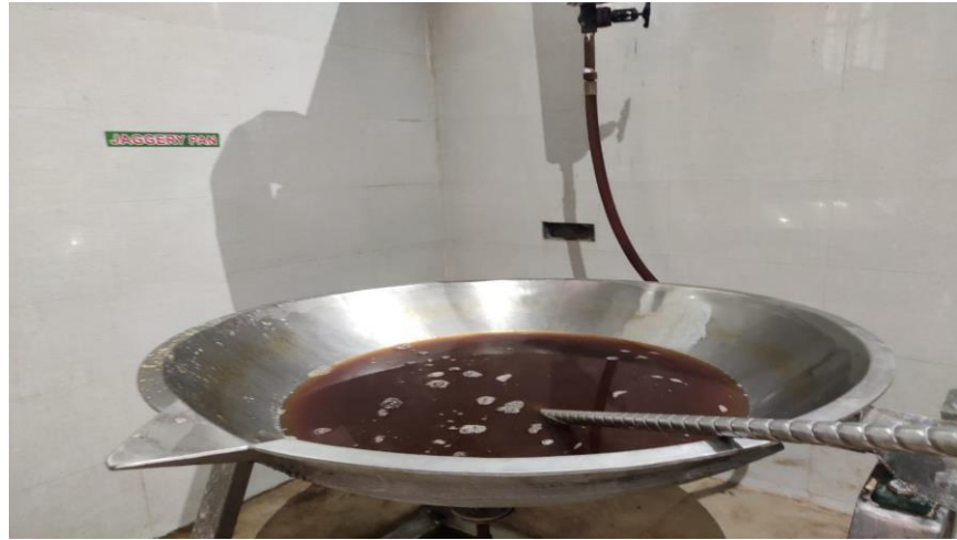
Preparing Jaggery from toddy