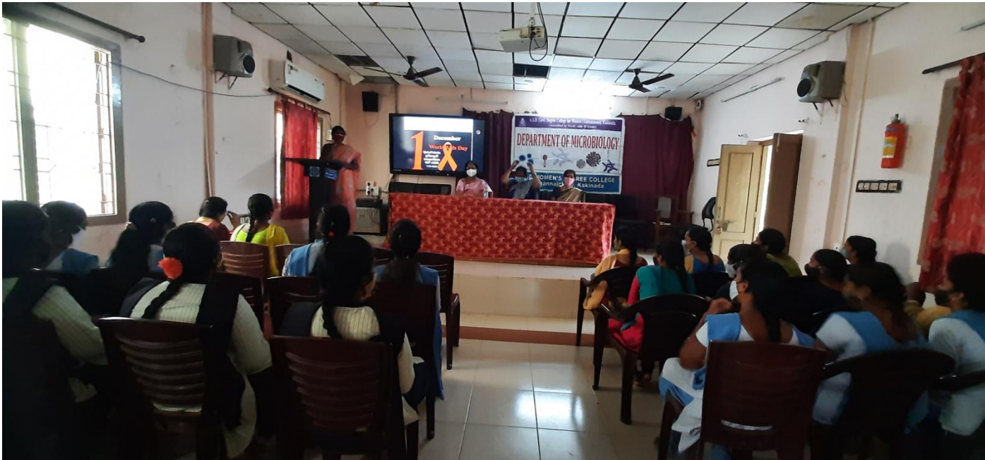
Fig: Prizes announcements