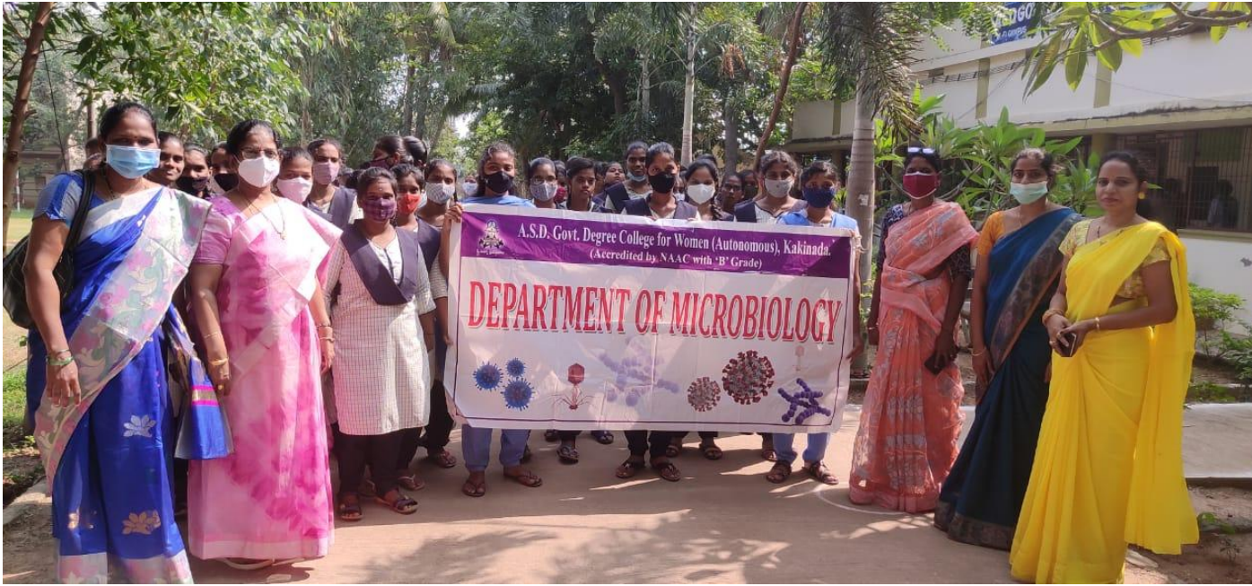
Fig: Rally by Microbiology students along with NSS & RRC students