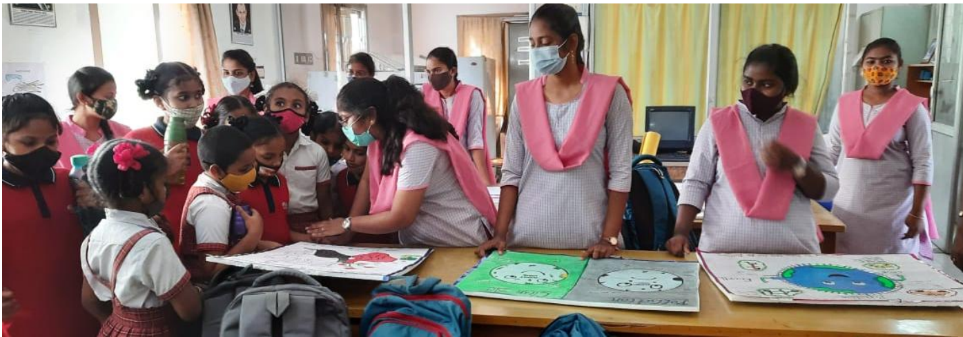
School Children Visiting to various Exhibits on Environmental Pollution