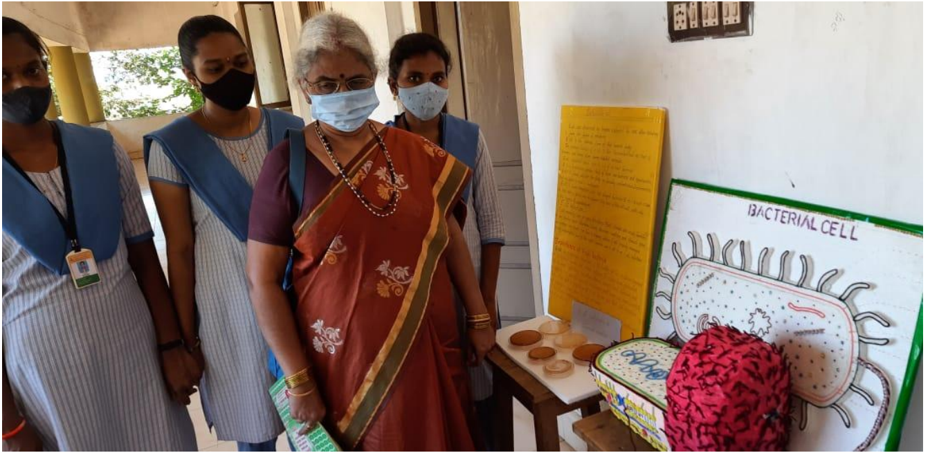
Live Demonstration on Bacterial Cell & Growth