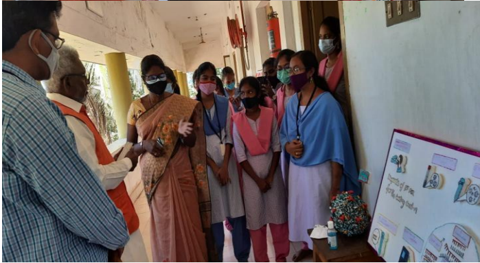
Stall on Blood Group Typing Disease