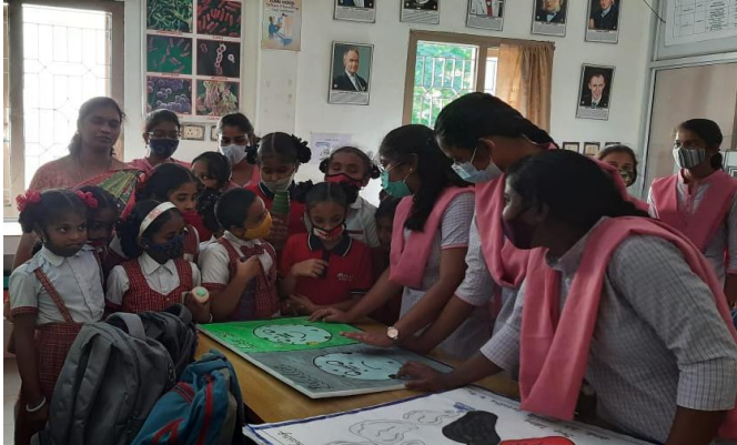
College Faculty visit to exhibits