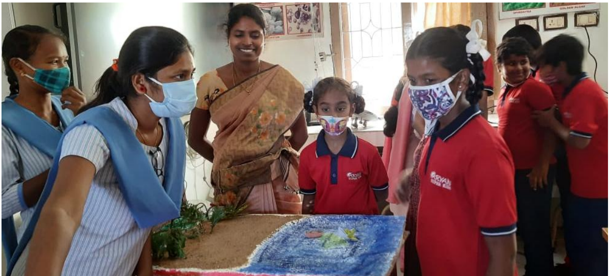
Stall on Concept of Bioremediation