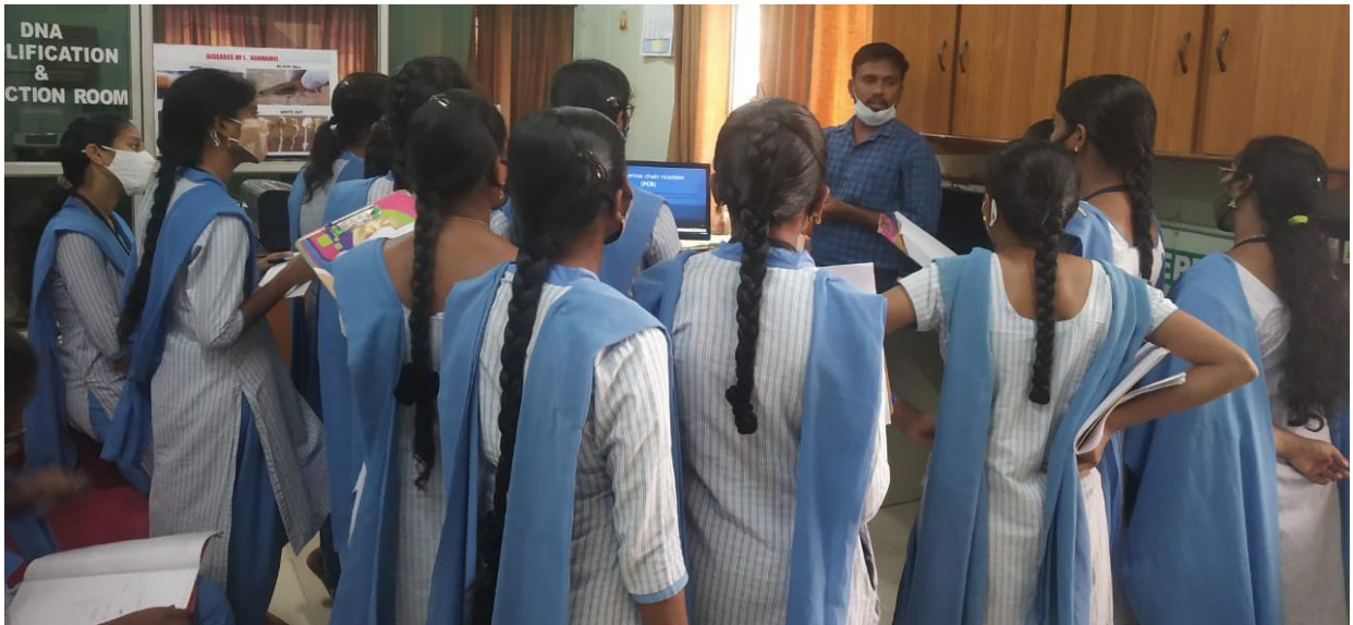
Field observation of Microbiology students to PCR/Molecular Biology laboratory, SIFT, Kakinada