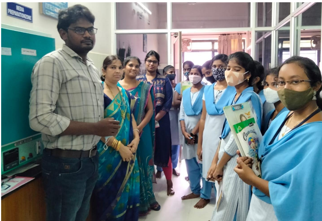
Field visit by III. B.Sc Microbiology students to Microbiology laboratory, SIFT, Kakinada