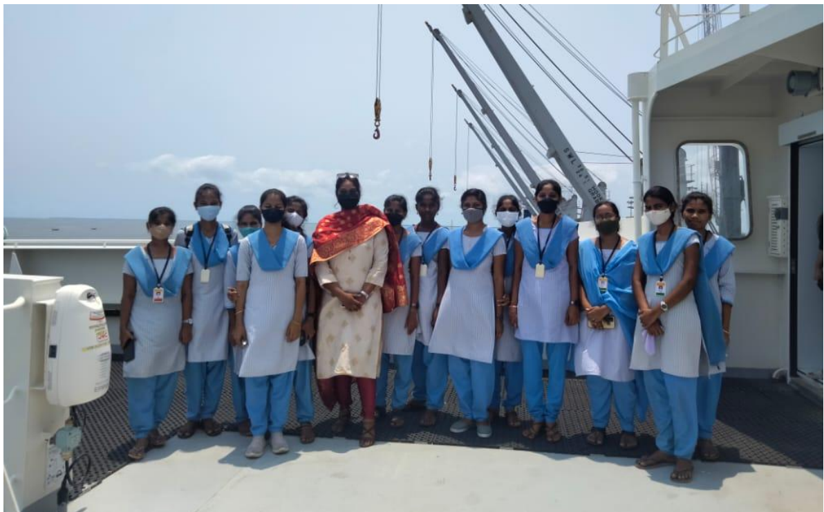
Field visit by III. B.Sc Microbiology students to KSPL Port, Kakinada