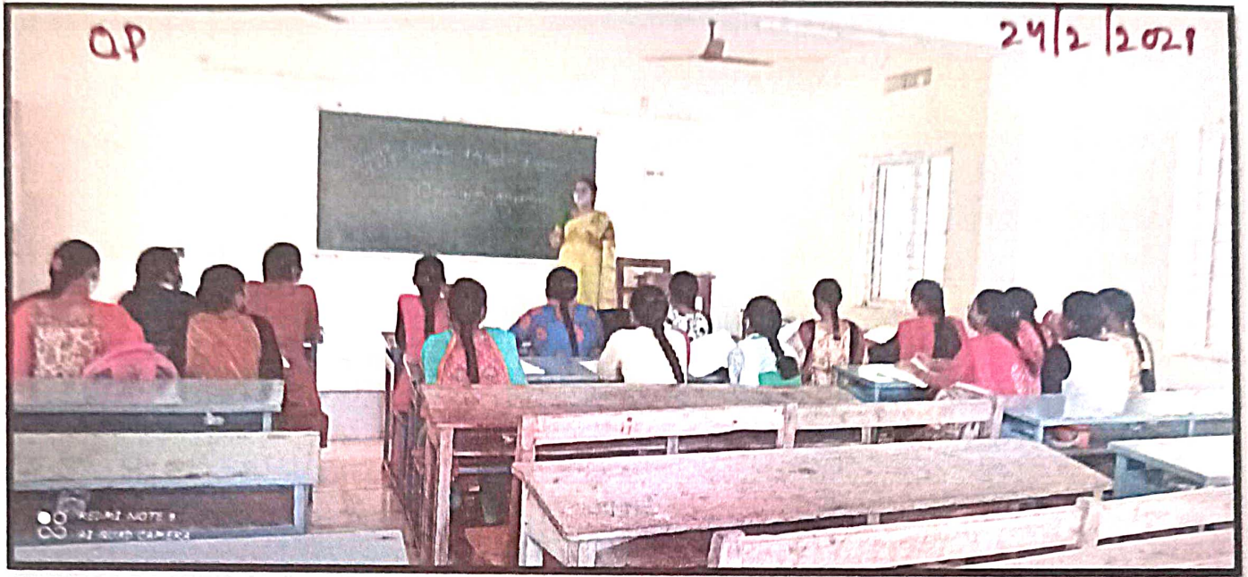
1 st year students Participated in Orientation Programm.