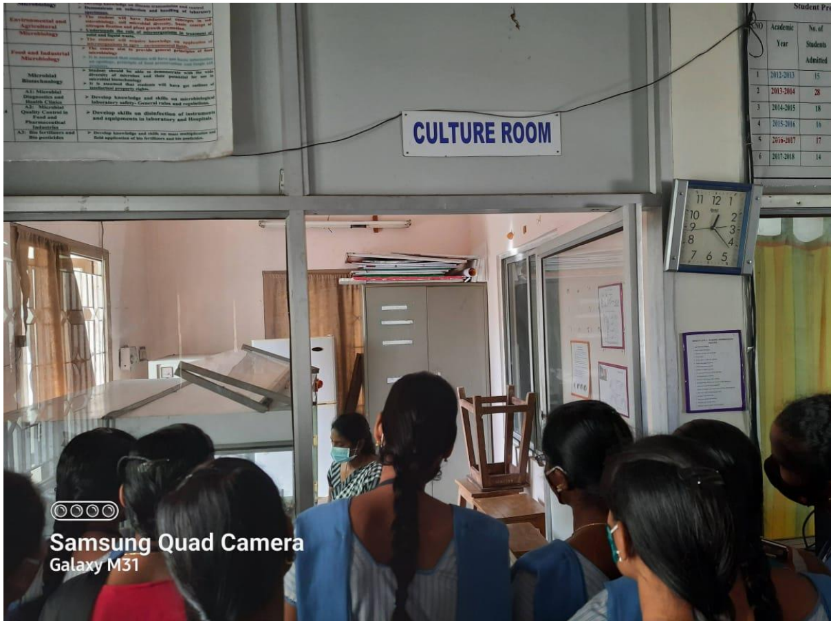
Students observing culture room in Microbiology laboratory