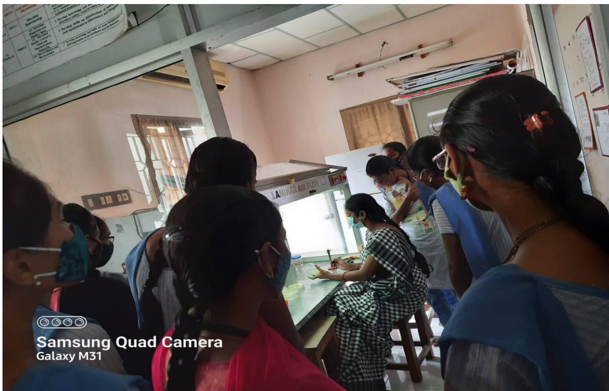
Students observing Laminar Airflow chamber in Microbiology laboratory