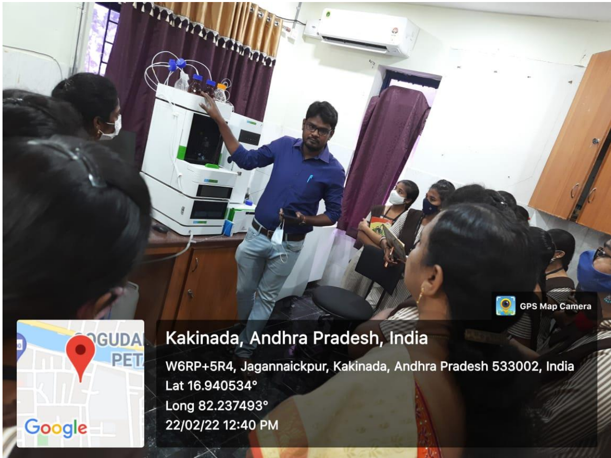
Students Learning about the mechanism of HPLC