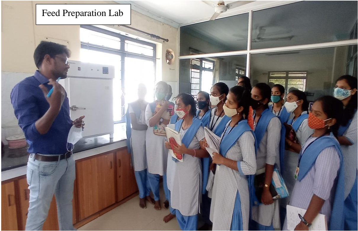
Feed Preparation Lab