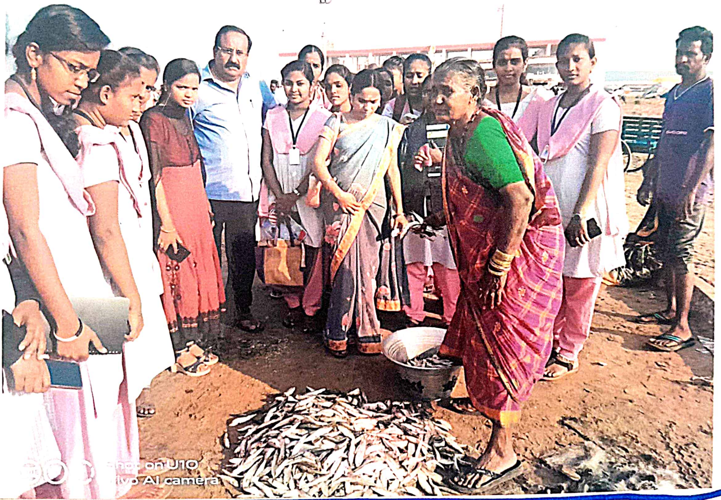
students observed the Marine fishes .