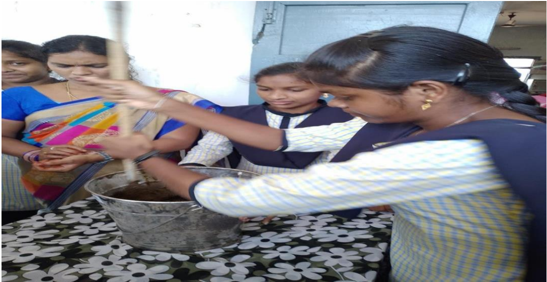
Students taking part in preparation of Jeevamrutham