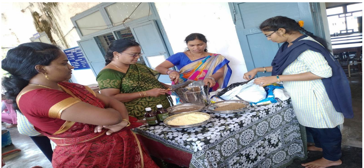
Faculty of the Department demonstrating the preparation of Jeevamrutham to the student