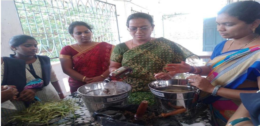
Faculty demonstrating the preparation of Nemastram to the

Department started Certificate Course on Organic Farming, Faculty of theDepartment gave demonstration how to prepare Nemastram to the Certicate course enrolled Students