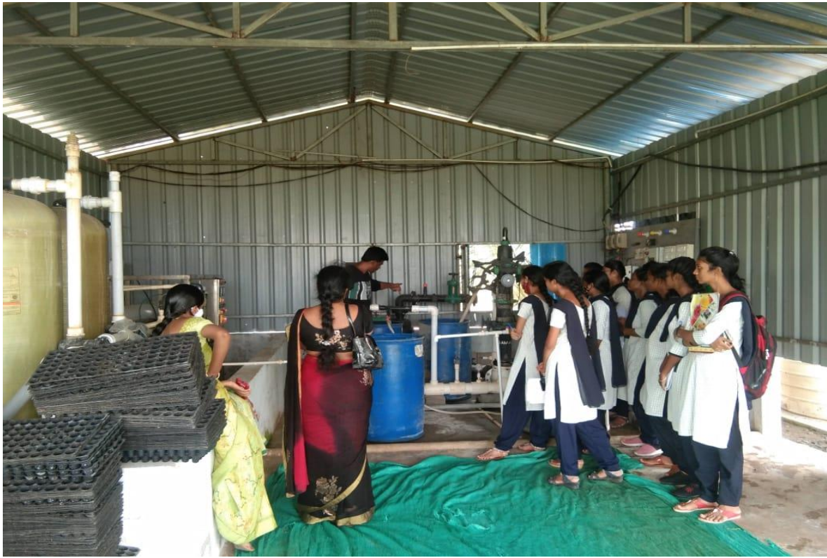
Students learning about Filtration process