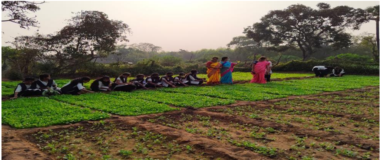
Sri B. Veerabhadra Rao garu Owner of olericulture fields inSarpavaram explaining about cultivation of vegetable crops