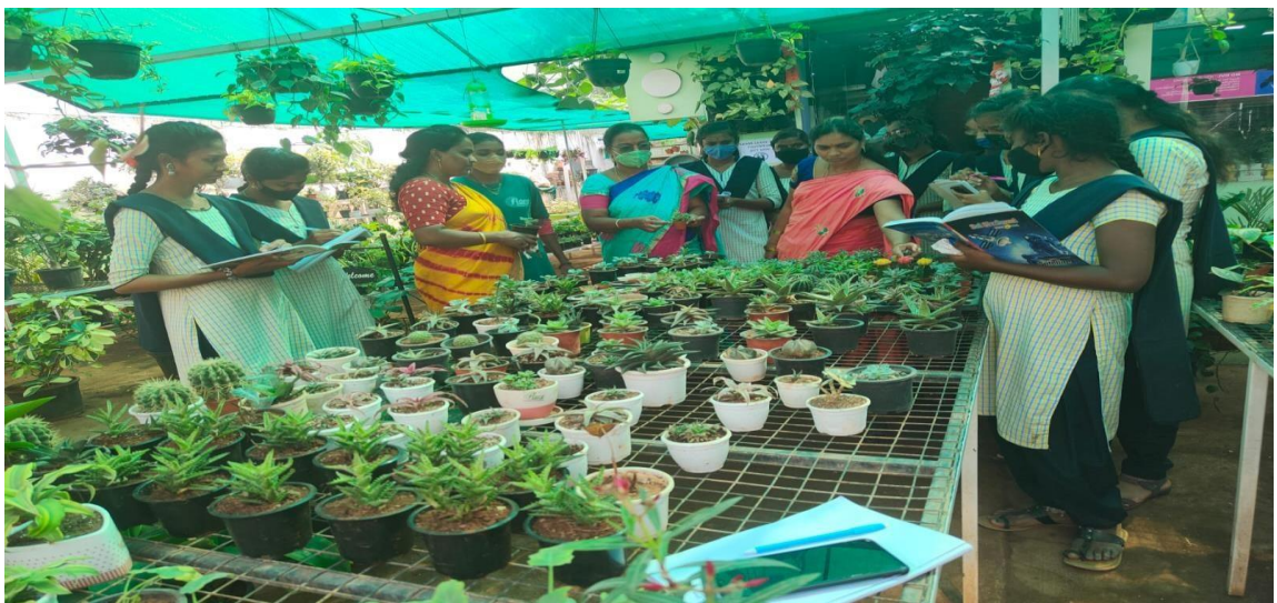
Faculty & Students of the Department visiting Local Nurseries in Kakinada

Faculty of the Dept & Students of CBHT group visited local nurseries and Olericulture fields in Sarpavaram, Kakinada. In this field visit, students learnt about various propagation techniques, different tools used in Nurseries and cultivation of, Bonsai varieties and Succulents etc. In Sarpavaram Olericulture fields, students learnt about various cultivation practices to be followed while cultivating different vegetable crops, measures to be taken while controlling pests & diseases attacking various vegetable crops.