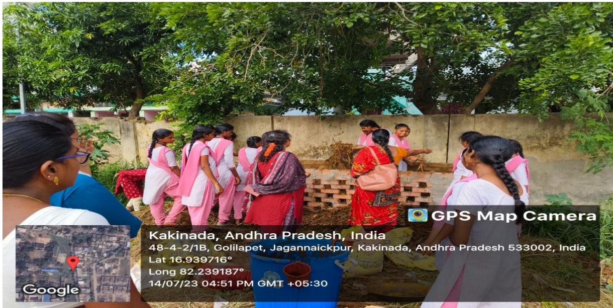
Preparation of Farmyard manure in NADEP Compost pit by faculty and Students of the Department