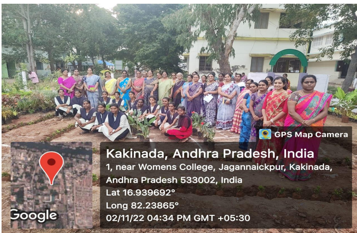
Faculty of the College who attended Inauguration of Botanical Garden