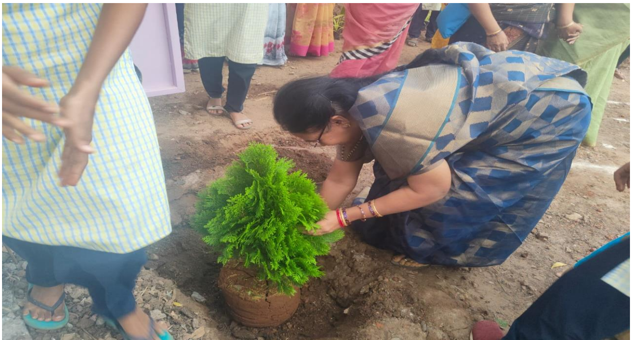
Plantation by Principal Madam of the college