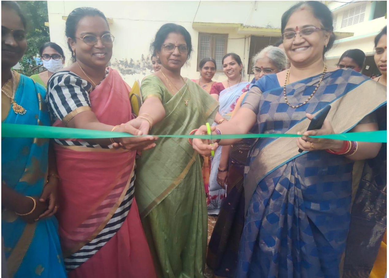
Inauguration of Dr.Janaki Ammal Botanical Garden