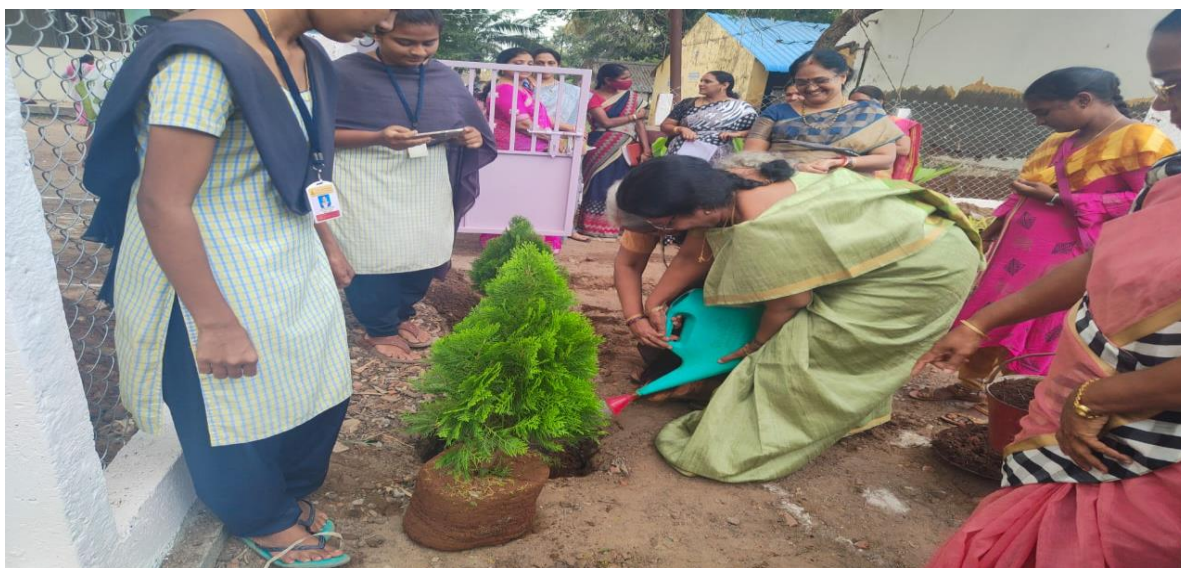
Plantation by Vice Principal Madam of the College