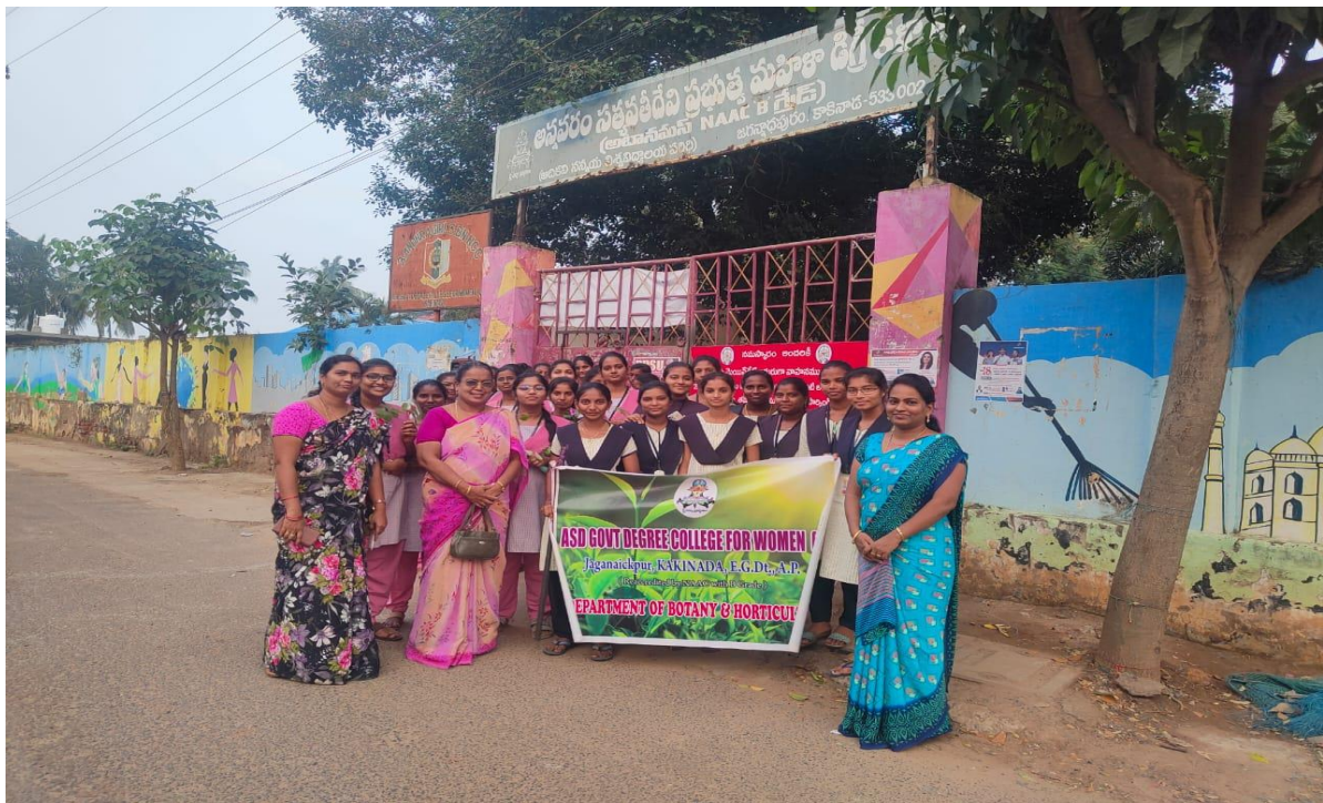
Faculty and Students of the college participating in Medicinal Plant drive