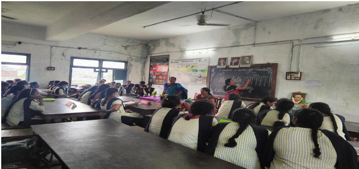
Quiz master asking questions to the team members

Department observed 200 th Birthday celebrations of Gregor John Mendel who is the Father of Genetics. In connection with this day, Department conducted Quiz Competition to the students on the topic "Recent Advances in the field of Genetics". The participants are divided into four teams and the winners out of the Four teams have been announced. No. of Students Participated in the programme are 50