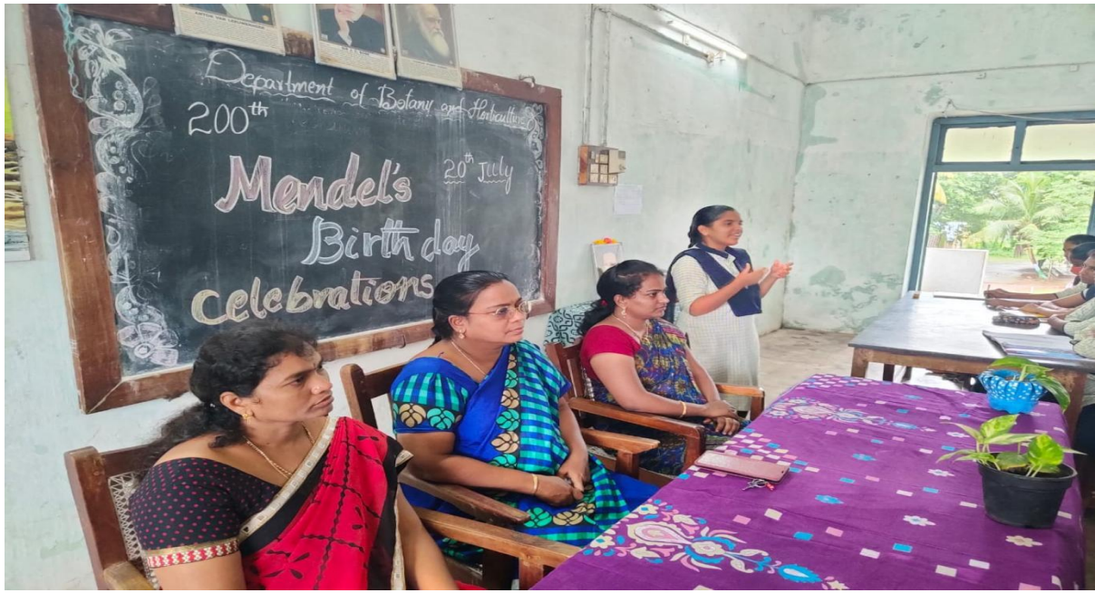
Ms.Yamini II CBZ participating in Elocution