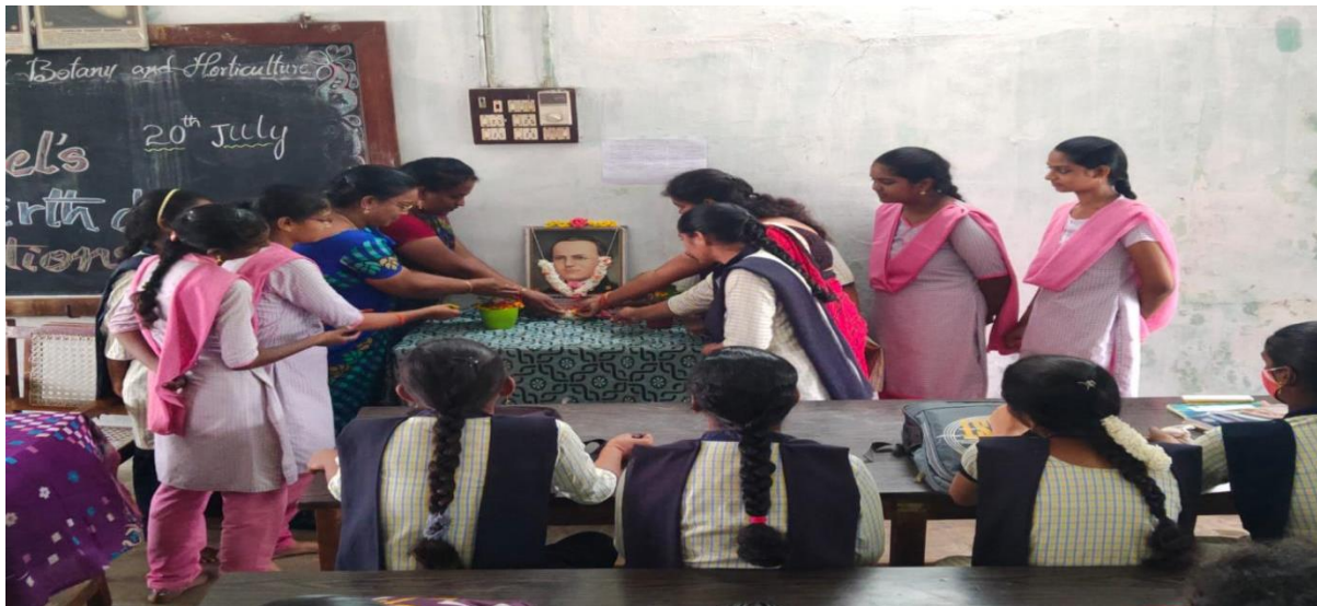
Staff & students of the Dept of Botany & Horticulture observing Mendel's 200th Birthday celebrations

Department observed 200 th Birthday celebrations of Gregor John Mendel who is the Father of Genetics. In connection with this day, Department conducted Elocution Competition to the students on the topic " Genetically modified foods and their impact on Humanbeings" No.of Students Participated in the programme are 50