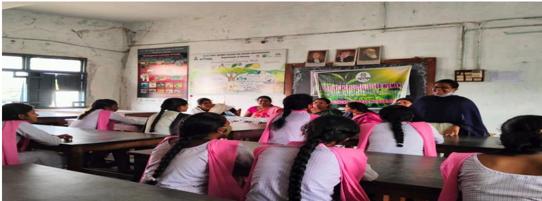
Students speaking on the theme of World Earth Day 2022