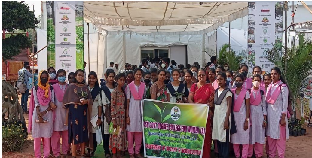
Our Dept Students at Nursery & Landscape Expo at Govt Arts College (A) Rajamahendravaram