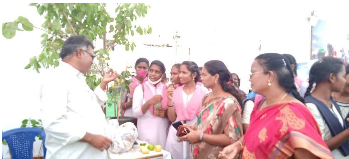
Students Learning About the growth Pattern & Yield of various Fruit Yielding plan