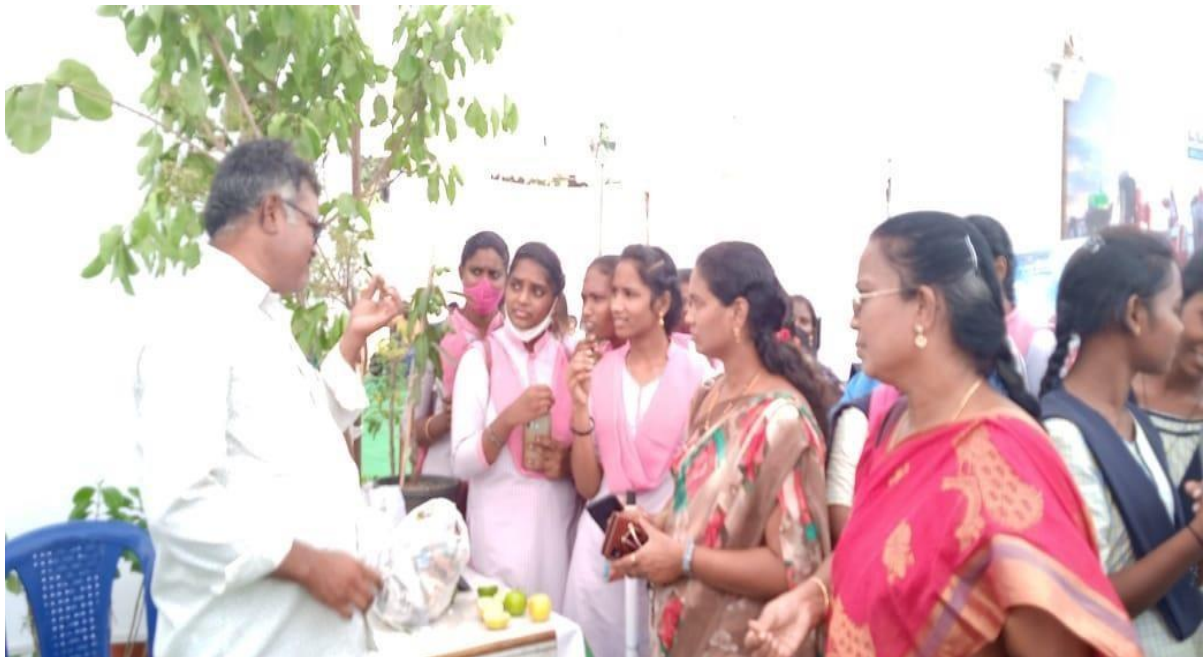
Students Learning About the growth Pattern & Yield of various Fruit Yielding plan