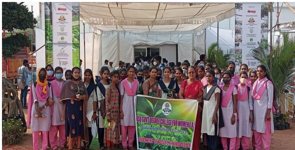
Our Dept Students at Nursery & Landscape Expo at Govt Arts College (A) Rajahmahendravaram

Faculty & Students of the Department visited Nursery & Landscape Expo 2022 organised by Agritech ,Andhrapradesh at Govt. arts College Autonomous Rajahmahendravaram. Students learnt about various plants best suitable for Gardening and Bonsai making and also for Agricultural purpose No of students participated in the Programme are 33