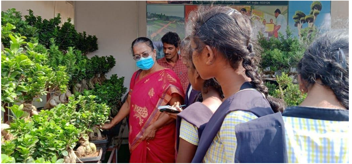
Students Observing Bonsai Plants