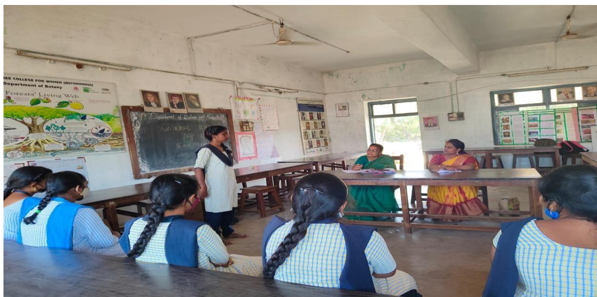
Students Participating in Elocution competition on the Theme “Integrated approach in Science & Technology for a sustainableFuture”