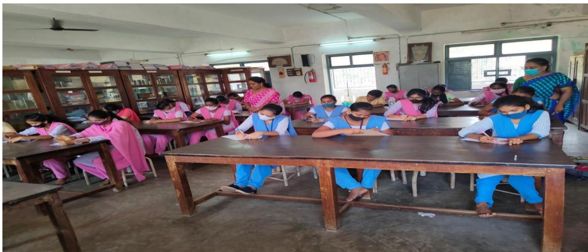
Students participating In Essay Writing Competition

Faculty of the Department conducted Essay writing on the theme Contribution of Scientists in the field of Biology in connection with World Science Day No of students participated in the Programme are 25