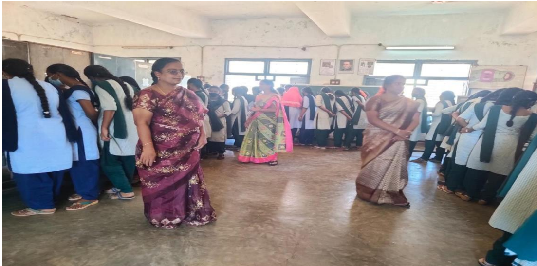
Intermediate Students of AS Junior College, Kakinada Visiting The Science Exhibition

Intermediate Students of AS Junior College, Kakinada & Aryan Public School Kakinada visited The Science exhibition. Students displayed various models Equipment available with the labs and Horticultural tools to the students in the Science Exhibition No of students participated in the Programme are 200