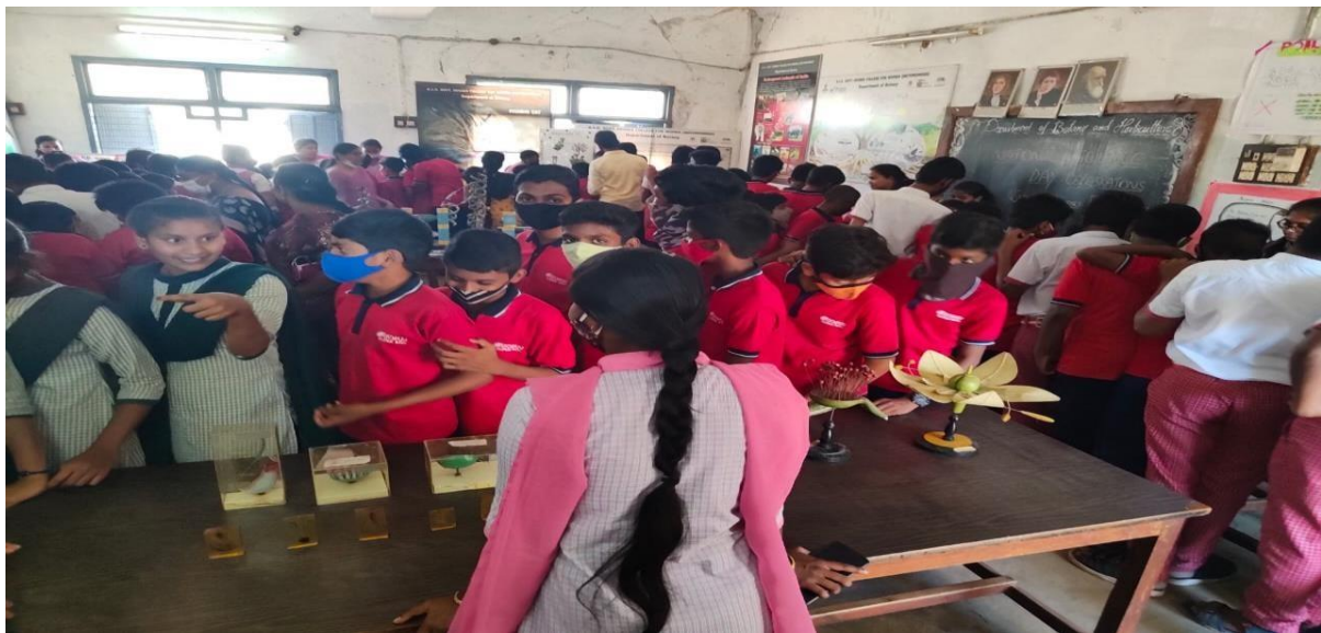
Students Of Aryan School, Kakinada Visiting The Science Exhibition