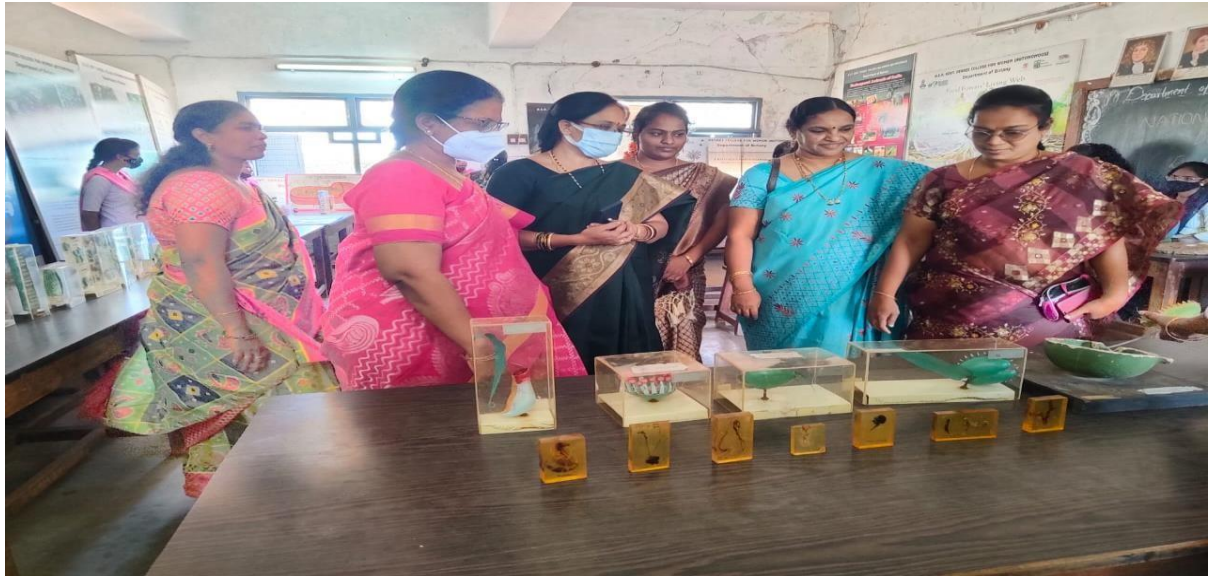
Principal Madam ,Vice principal Madam & IQAC coordinator Madam Visiting the Science Exhibition