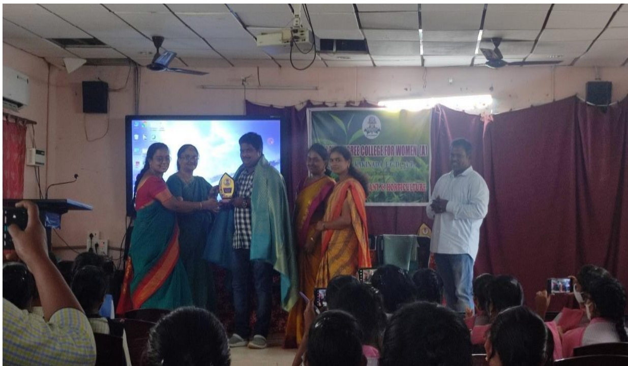
Felicitation .Programme of Resource persons