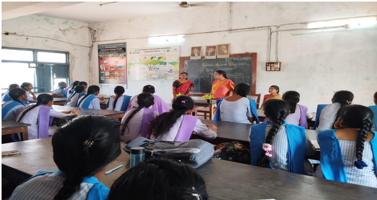
Faculty conducting Quiz Competition to the students