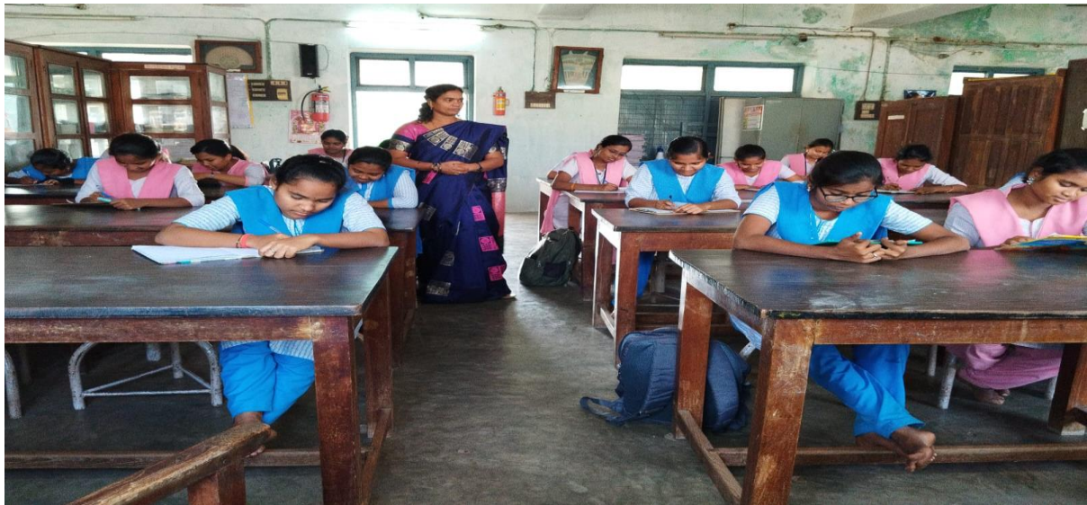
Students writing Essay Writing on conservation of soil