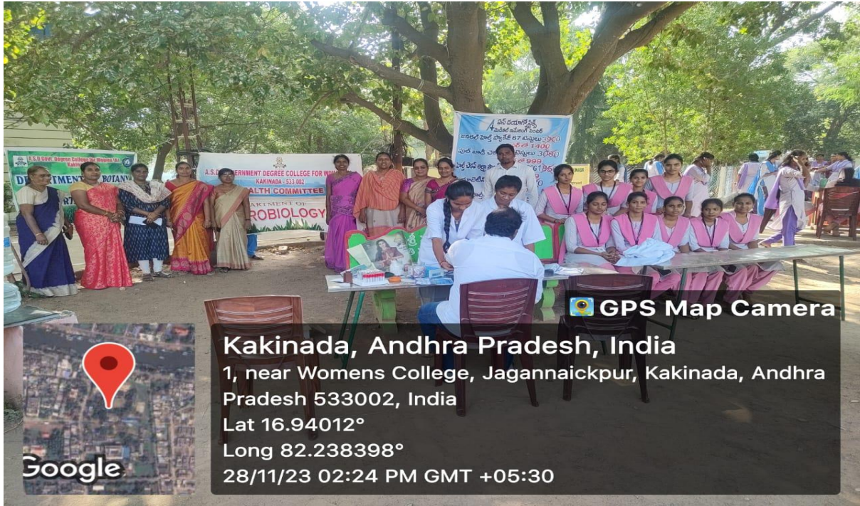
Faculty & Students of the college in the Free Health Check up Programme