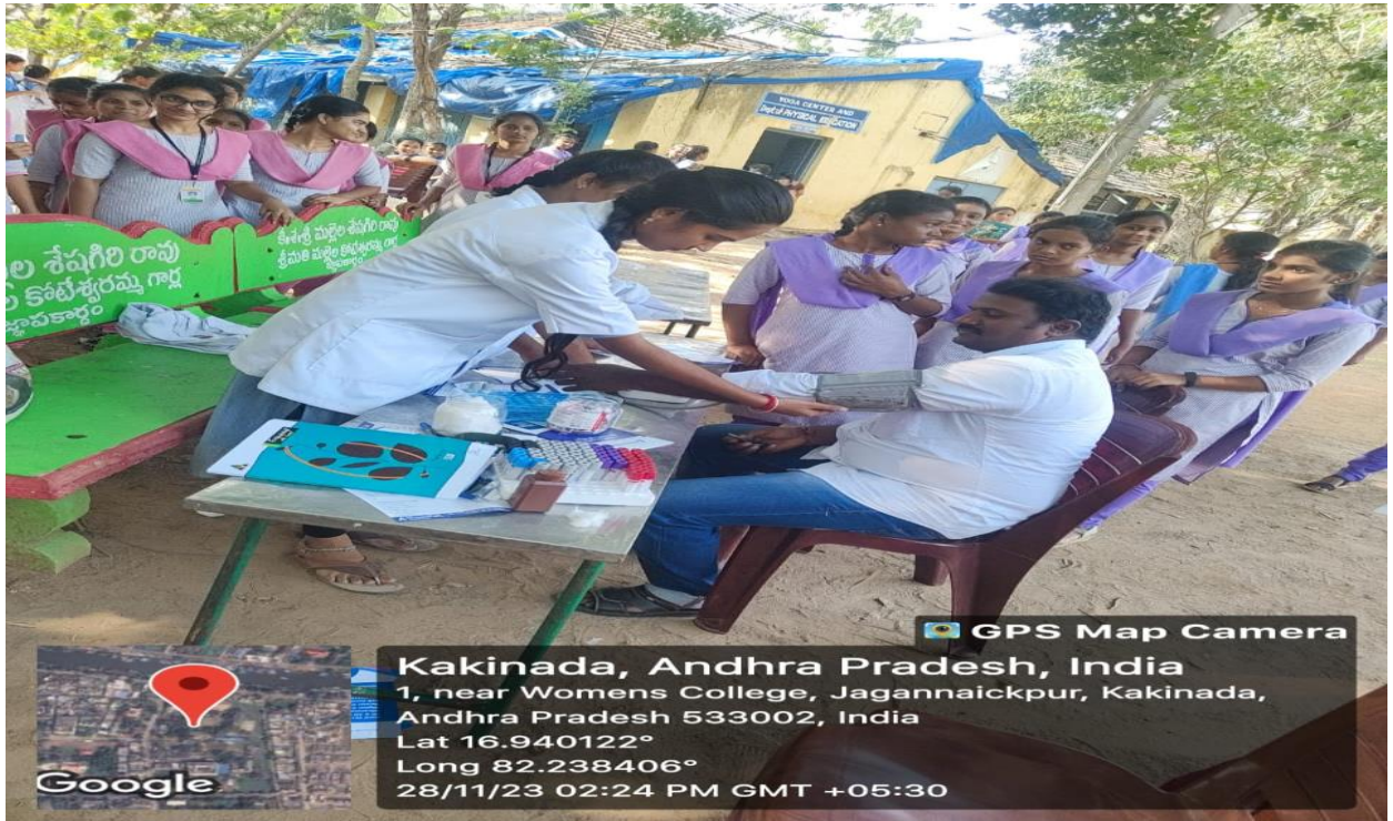
ACE Diagnostics Staff performing tests to Students Parents & Staff