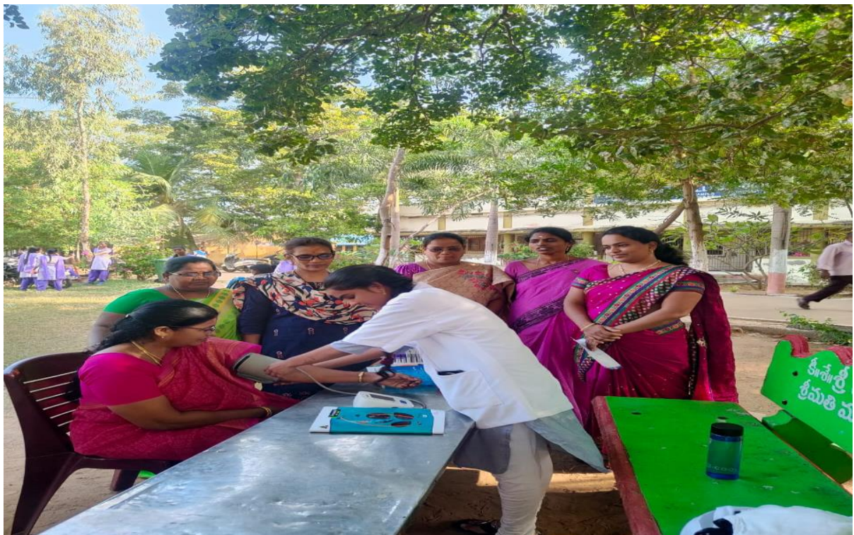
ACE Diagnostics Staff performing tests