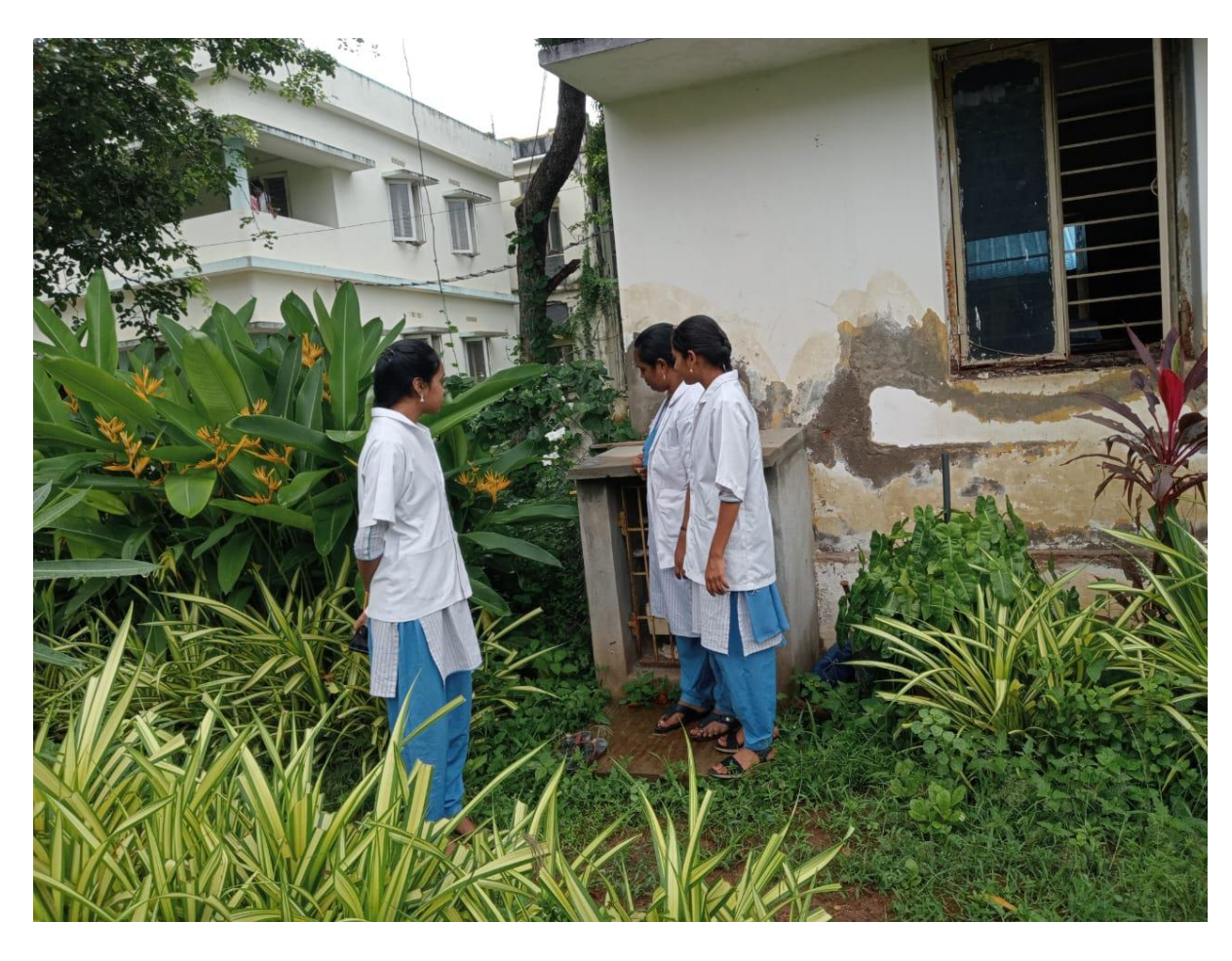
Pic: Project based learning