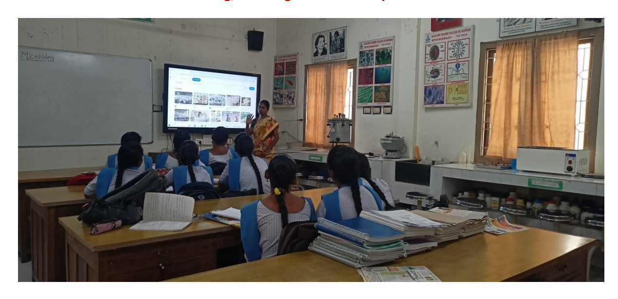
Fig: ICT based teaching