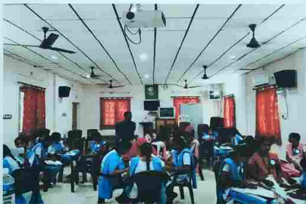
Group Activity on Reading Strategies