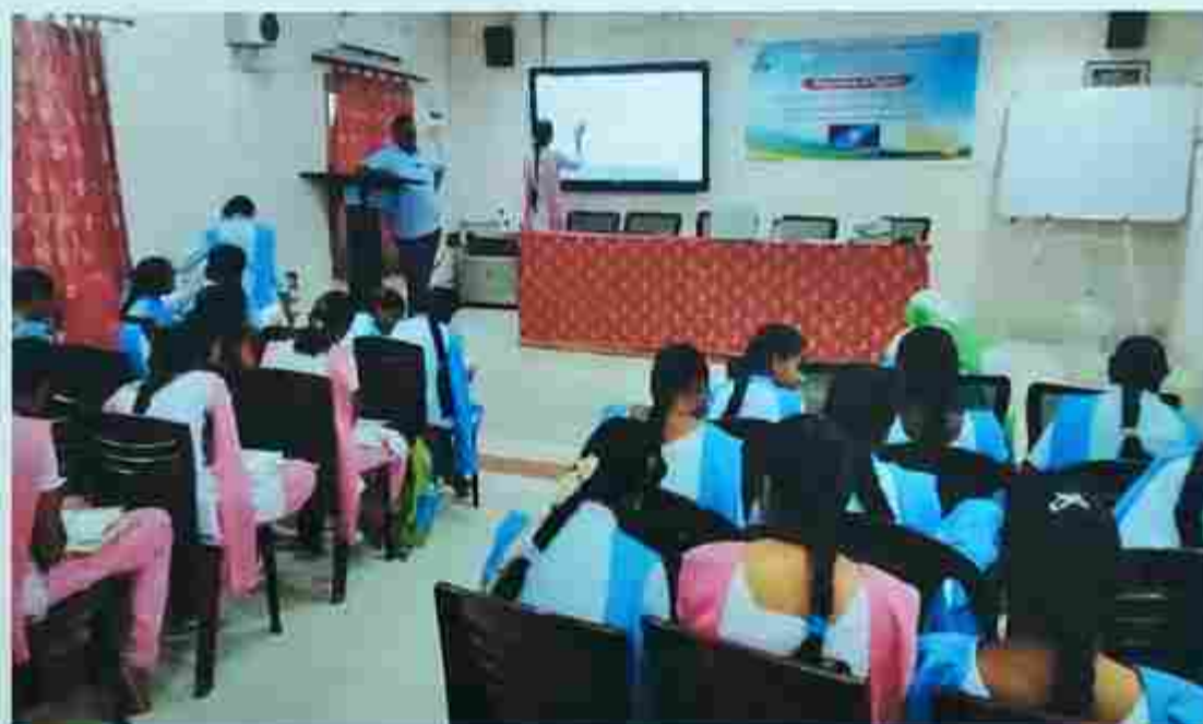
A student preparing PPT on "Self Defense"