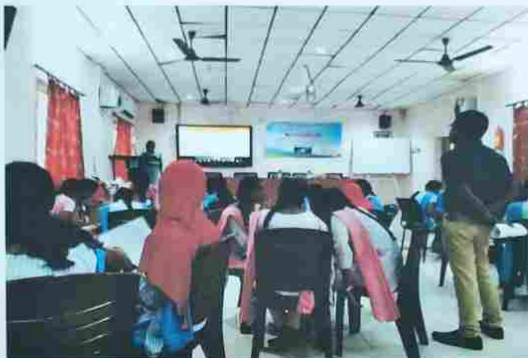
The participant is demonstrating her write up on SQ3R on the given passage