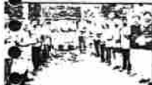
కొనాడ నగరం లోని వాణిజ్య కార్యకర్తల సమావేశం

కొనాడ నగరం లోని వాణిజ్య కార్యకర్తల సమావేశం కొనాడ నగరం లోని వాణిజ్య కార్యకర్తల సమావేశం... (Text describing the meeting)