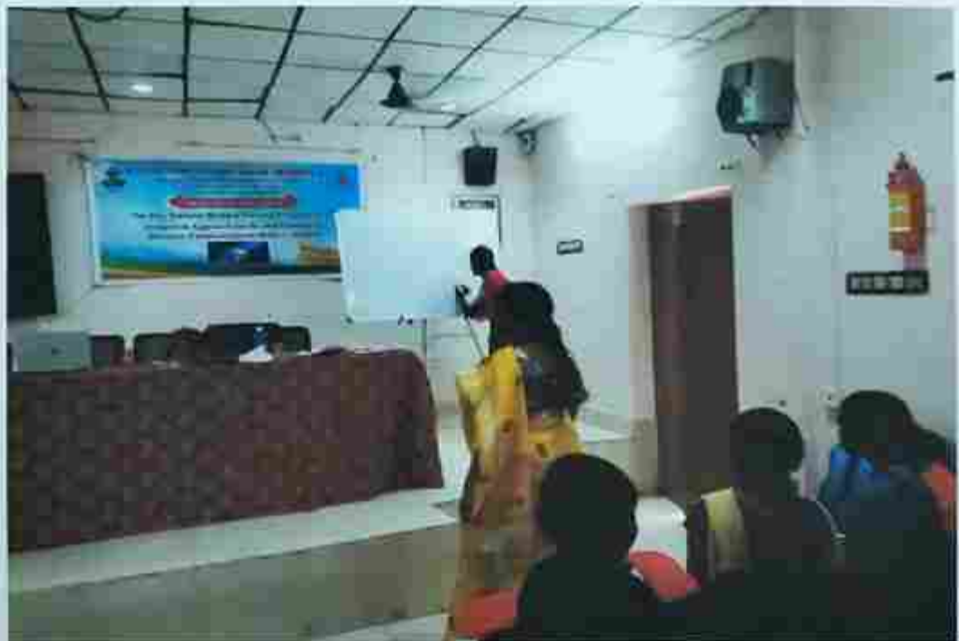
Participant's demonstration on Synonyms of a word and its shades of meanings