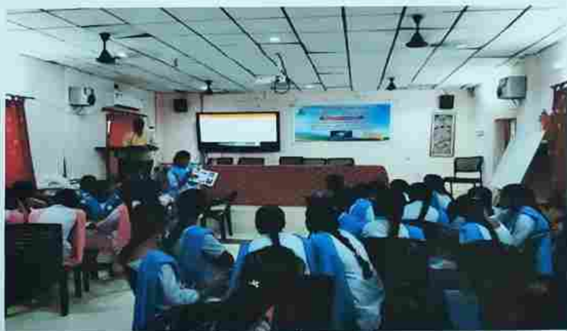
Student selling her product

JAM and Selling their products were the activities conducted.