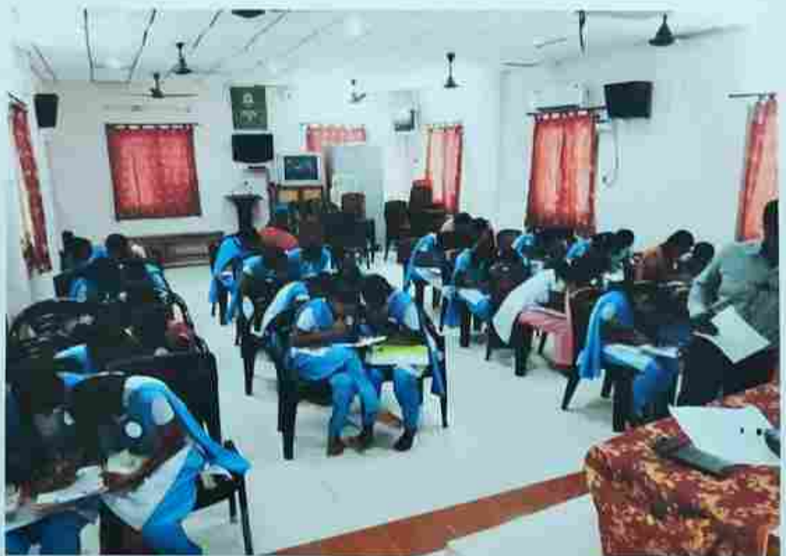
Pair Work on slogans