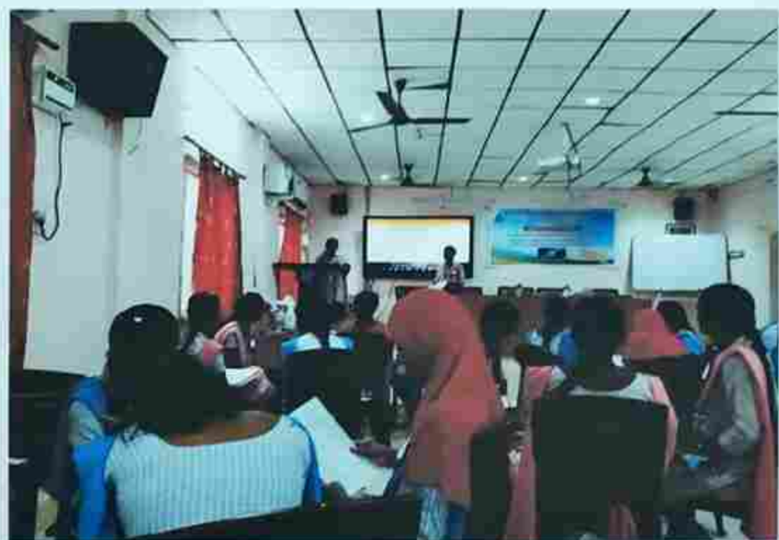
Students' participation in Presentation Skills