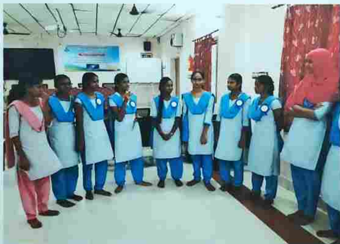
Warm up activity is conducted to students to put them in ease levels

facilities and overall rating of the programme. Based on Feedback, it was understood that above 90 % of students were very happy about the relevance of content, teaching inputs and learning outputs and gave Excellent on 5-point scale. On the average, student participants felt knowledge, subject expertise, explanation and approach by each resource person of the programme was very good. About feedback of facilities at training venue like ambience, lighting, refreshments and hospitality were given Excellent.