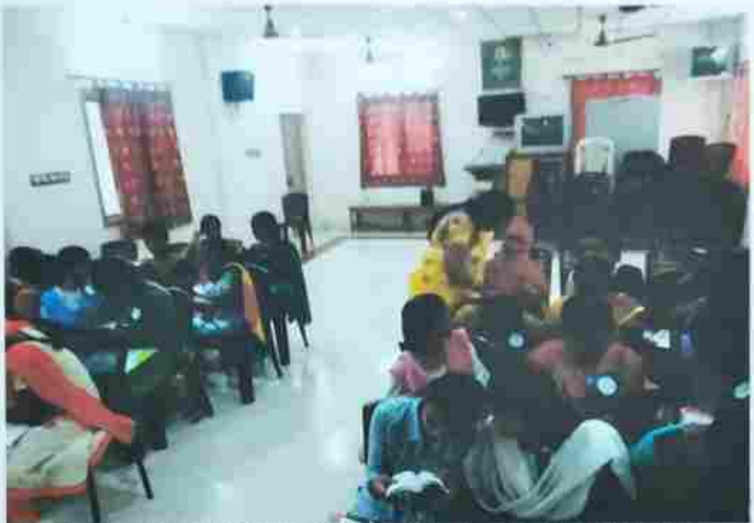
Ms. Jaya Resource Person assists students to recognize and develop vocabulary by using vocabulary-building strategies