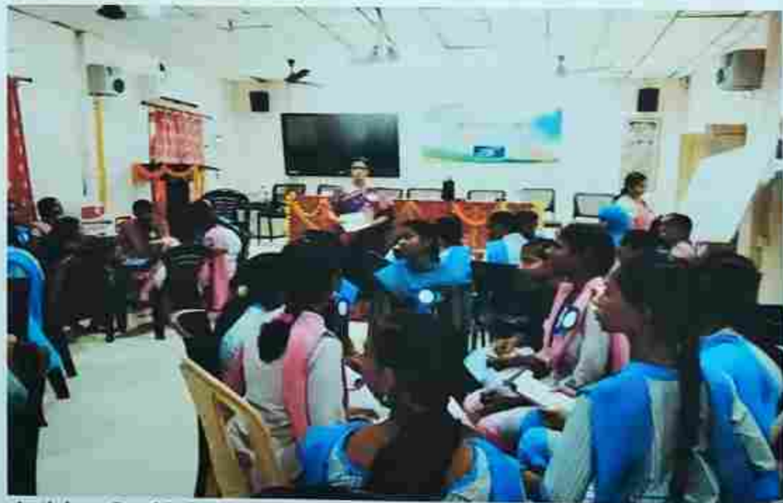
Activity: Jumbled sentences - Preparing a story - placing in an order