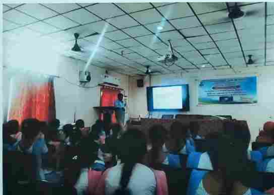
Students' involvement in identifying the words as well as generating words from each given hint