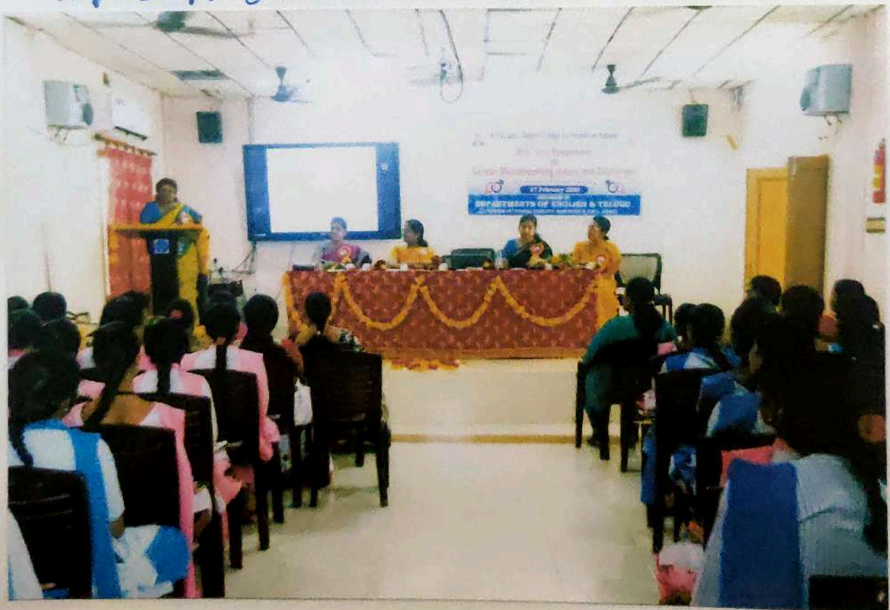
Discussion Session on "Gender Issues".